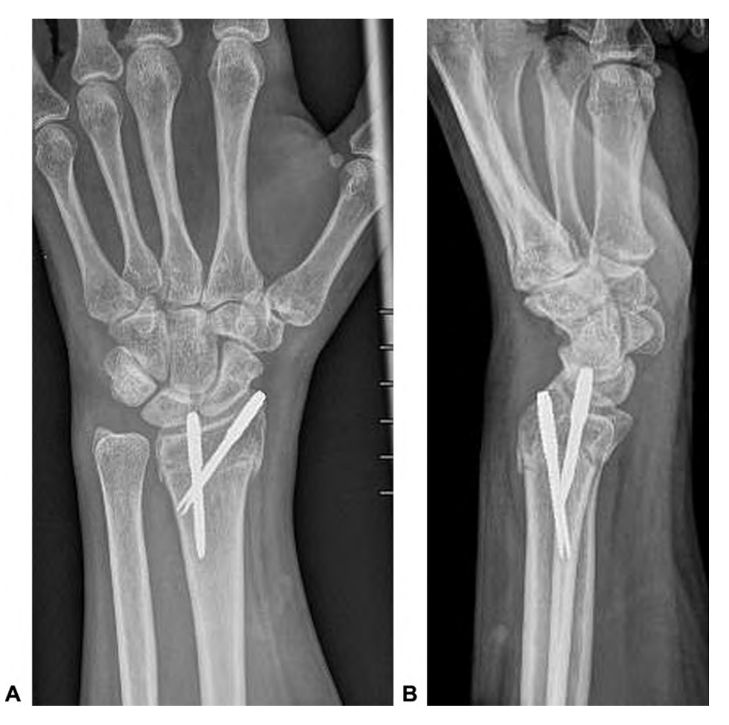
FIGURE 5: A Final anteroposterior radiograph of distal radius fracture after union and B final lateral radiograph of distal radius fracture after union.

flexion, a Patient-Rated Wrist Evaluation score of 4, and a Disabilities of the Arm, Shoulder, and Hand score of 0. She was highly satisfied.