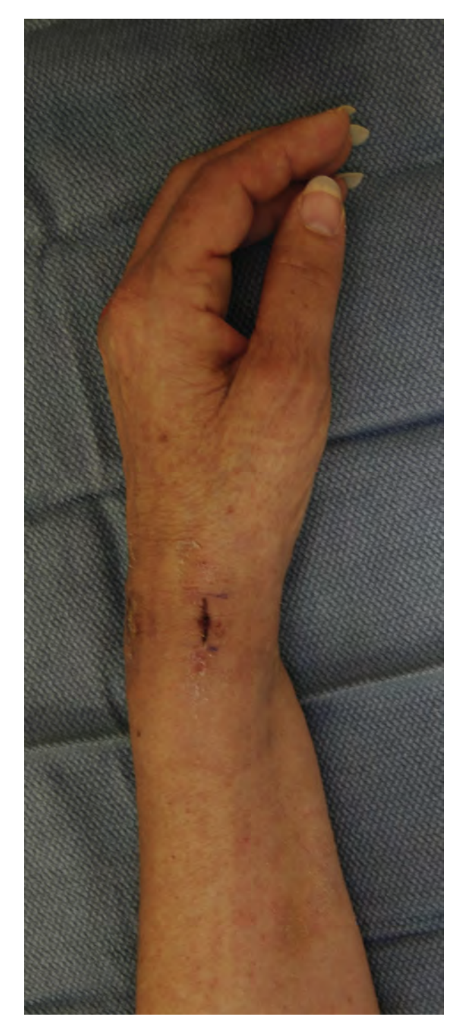
FIGURE 4: Image of the wrist 3 months after surgery, after it had united.